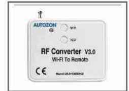
AZ RF WIFI 31 A Wifi Module