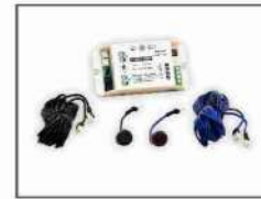
AZ SLD SBP 71 Photo Cell