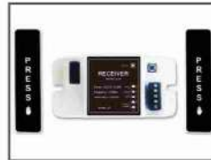
AZ SLD PB WL 70 Wireless Push Button & Receiver