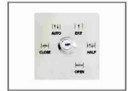
AZ SWD KS 430 Keypad